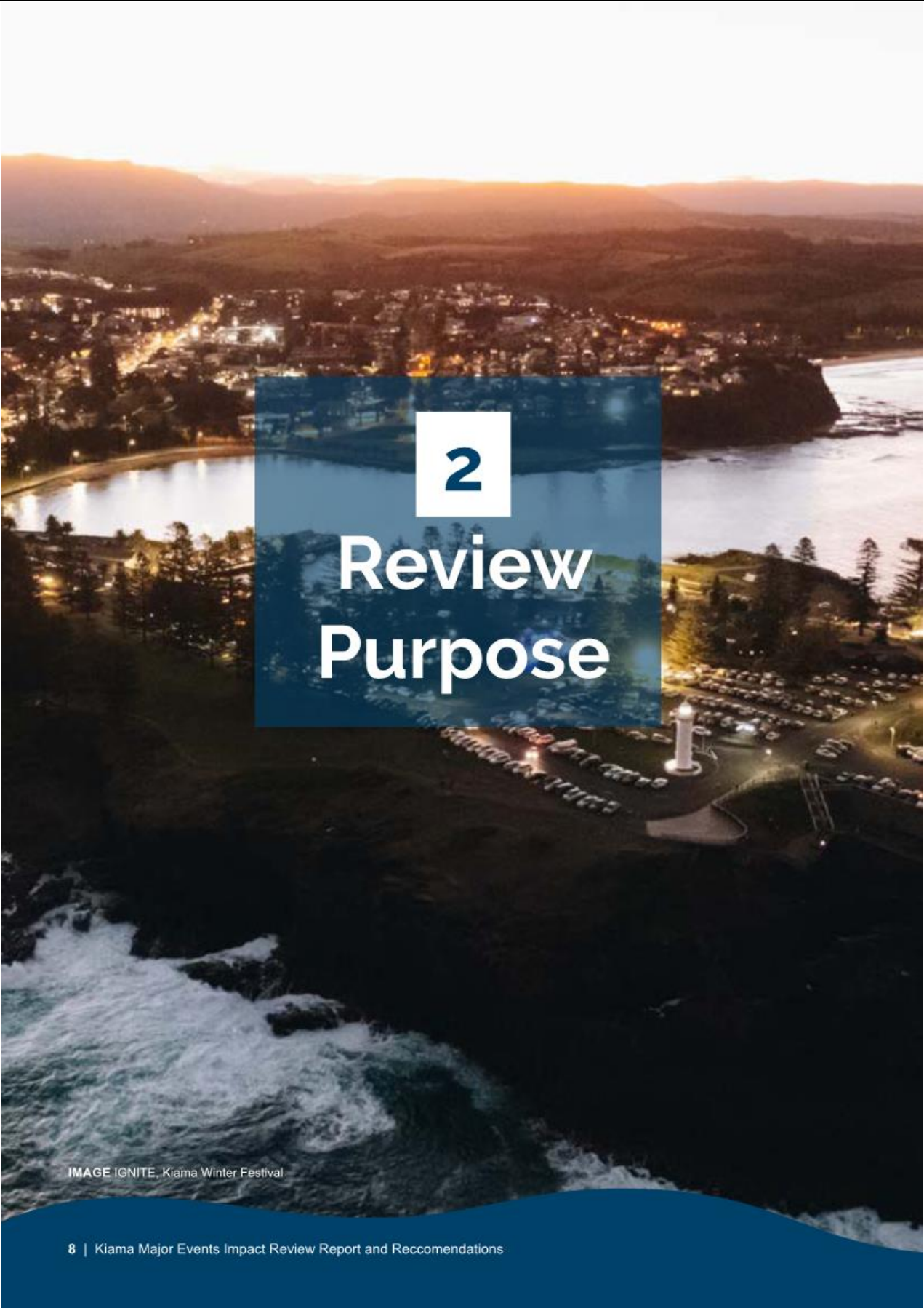
IMAGE IGNITE, Kiama Winter Festival