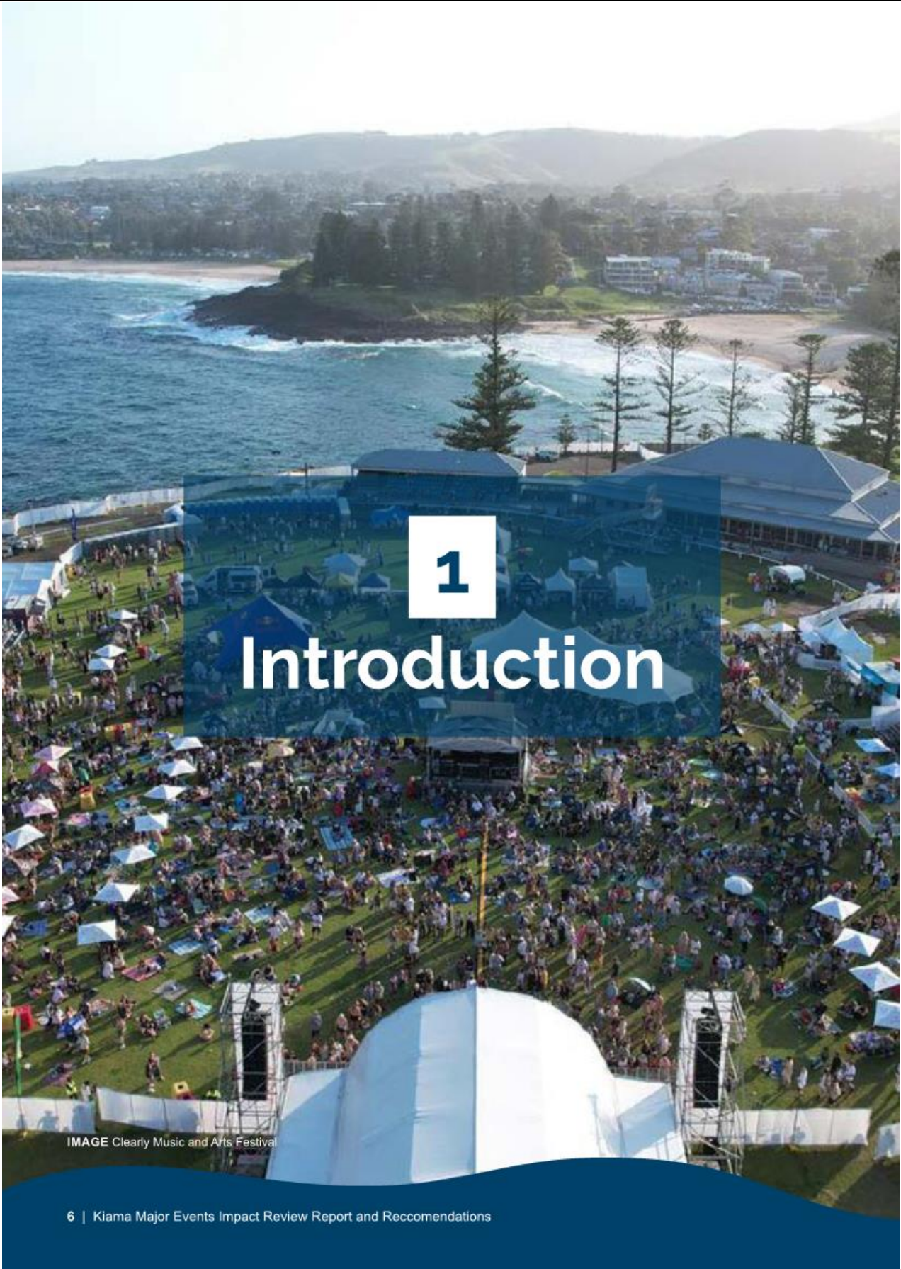
IMAGE Clearly Music and Arts Festival