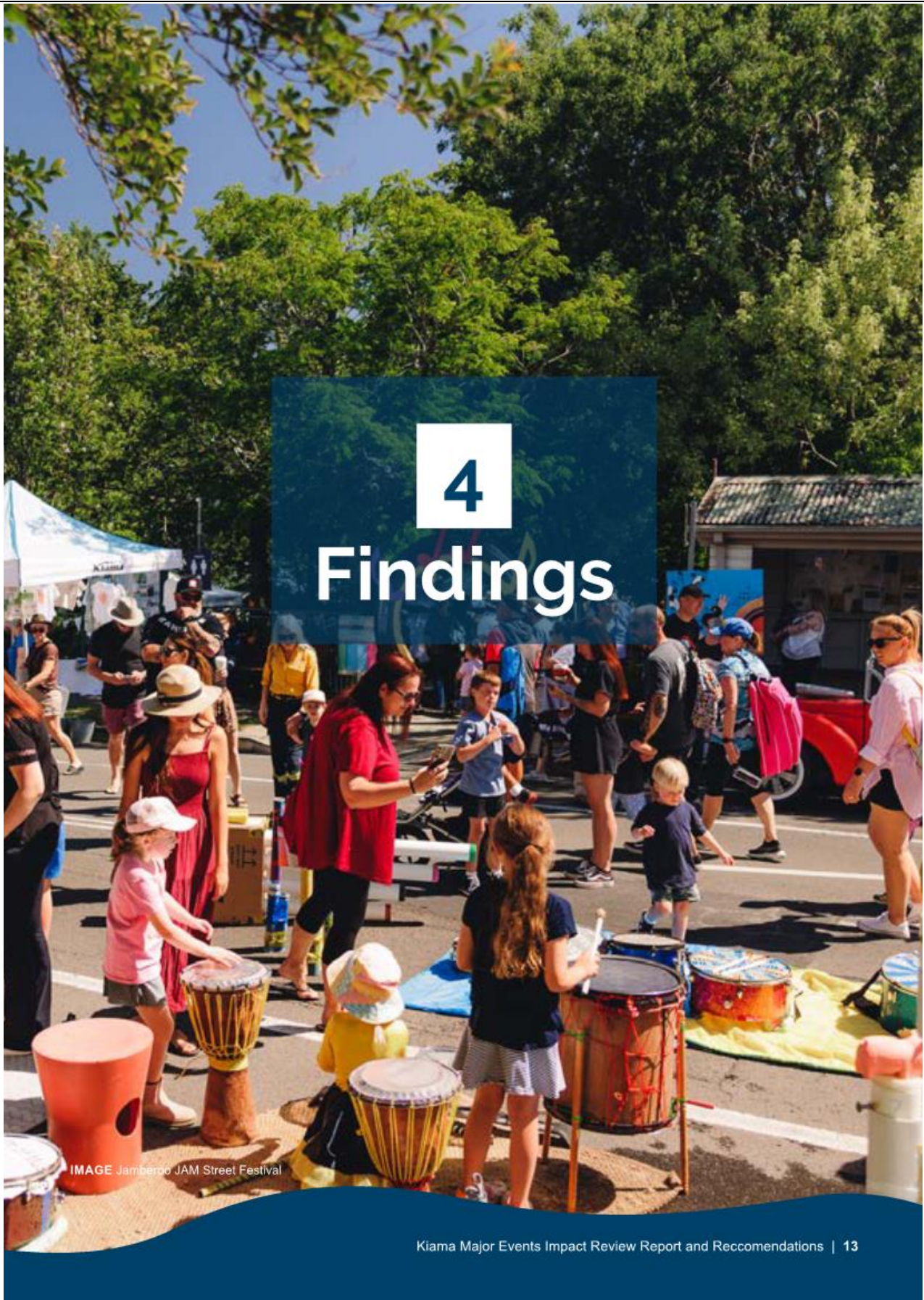
IMAGE Jamberoo JAM Street Festival